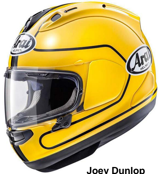
Joey Dunlop *NEW*