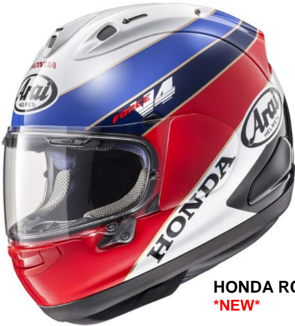
HONDA RC30 *NEW*